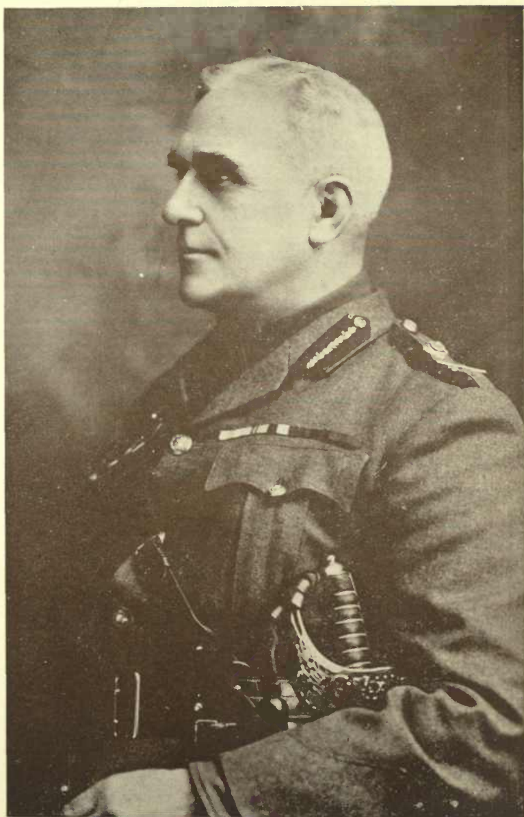
MAJOR-GENERAL SIR SAM HUGHES Canadian Minister of Militia During the Period of the War